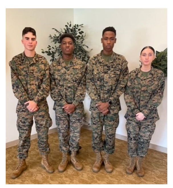
Clearwater High School JROTC Honor Guard