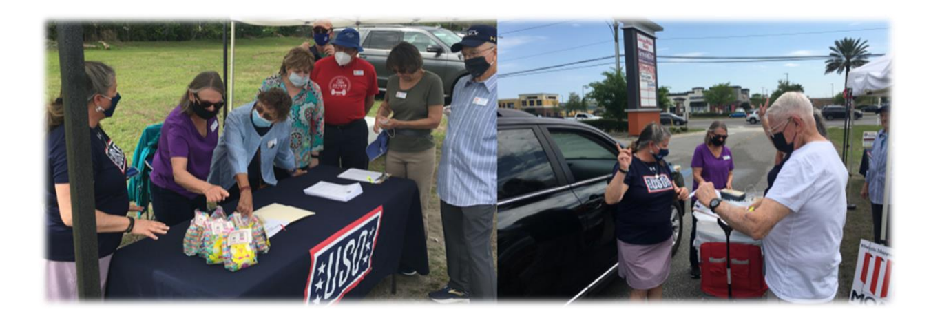
Volunteers Receive Instruction & To Go Delivery to Vehicles

Families had pre-registered with USO Mayport for 218 meals. Our Chapter used the last of our MOAA Foundation 2020-2021 Community Outreach Grant to fund this event through USO Mayport.