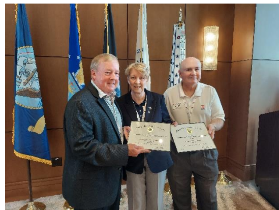
Double Five-Star Awards for KOS at the 2021 FCOC Convention held in Sarasota