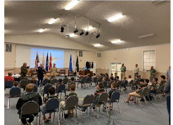
MOAA Class to Scouts: "During March and April 2021 Members of Indian River County MOAA Veterans in the Classroom Team conducted three Classes to The Trail Life Scouts and to the Heritage Girl Scouts at the King Baptist Church in Vero Beach, FL."

IRC-MOAA fulfills its mission through and with the County's Veterans Council. We take the lead on the County's two main Veterans events each year, the Veterans Day and Memorial Day programs on Memorial Sanctuary Island. Also, veterans bus transportation to the West Palm Beach VA Hospital. We take the leadership with UAV (Upward American Veterans, Veterans Outreach, Veterans helping Veterans (Home Repairs) and Veterans in the Classroom Program. Additionally, several MOAA Chapter members have become teachers in our very own MOAA Veterans in the Classroom Team serving all county school and several private schools and organizations. At least three of our members have taken leadership roles in 'Next Gen' which is a sub-section of the Veterans Council that includes mostly younger veterans (and a few of us older ones) who still served after 1990. Many members have volunteered