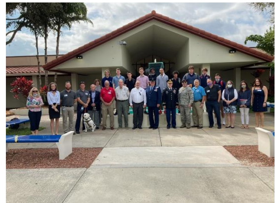
IRC-MOAA Officers took part in Veteran Interviews conducted by Vero Beach High School, Sebastian River High School and St. Edwards High School between January through May 2021