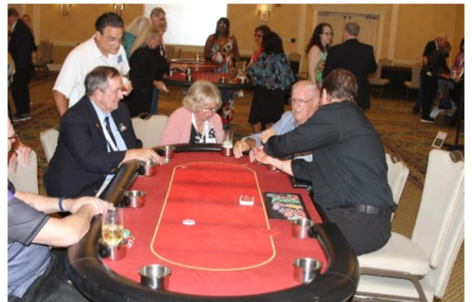
Casino Night activities. Big Winners??