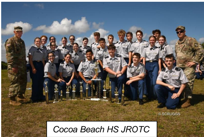
Cocoa Beach HS JROTC

The GDF was able to present every JROTC program with $2200 each, and 2 Civil Air Patrol units, 2 Sea Cadet units, and the Sea Scout Ship with $1200 each, as the new school year began. In addition, the GDF will purchase every county and district trophy and medal for seven Raider Challenge, Air Rifle and Drill events, estimated at $3600, thus saving the JROTC units over $250 per school. The total package will thus exceed $36,000. MOAACC is very proud of its impactful GDF 501(c) 3 supporting the youth in our community.