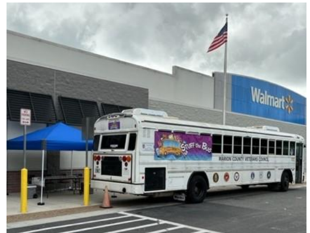
The "Stuff the Bus" bus parked at the ready to collect school supplies.