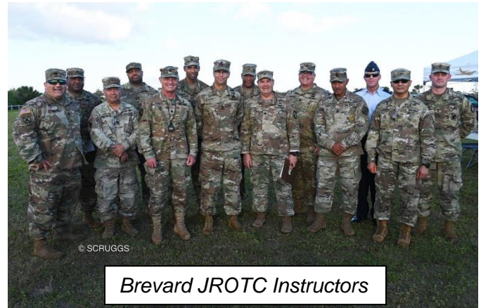
Brevard JROTC Instructors

Following a year in which donors and their annual Golf Tournament produced over $120K in funds, GDF's four pillars will all receive increased support: (1) Active Duty Military; (2) Veterans in Need; (3) JROTC, ROTC, other Cadet units; and (4) Veteran Organizations like Space Coast Honor Flight, Wreaths Across America and National Veterans Homeless Support. The GDF dispenses grants equal to what is received each year, less $5K in reserve, and the amount has gone up 10 percent or more the past five years-----even during COVID.