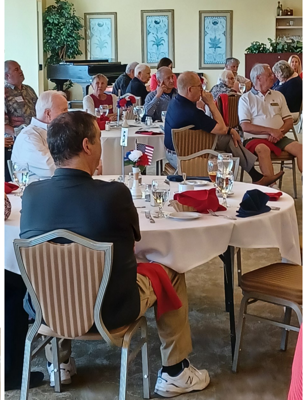
Audience is hanging on every word of the presentation