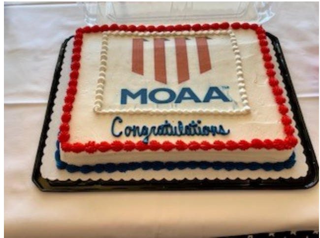
Chapter Directors Swearing In Celebratory Cake