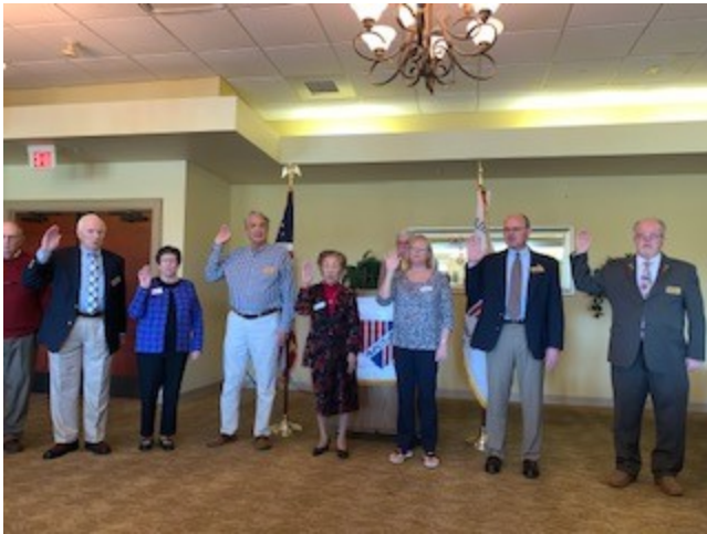
Board of Directors Swearing In Ceremony