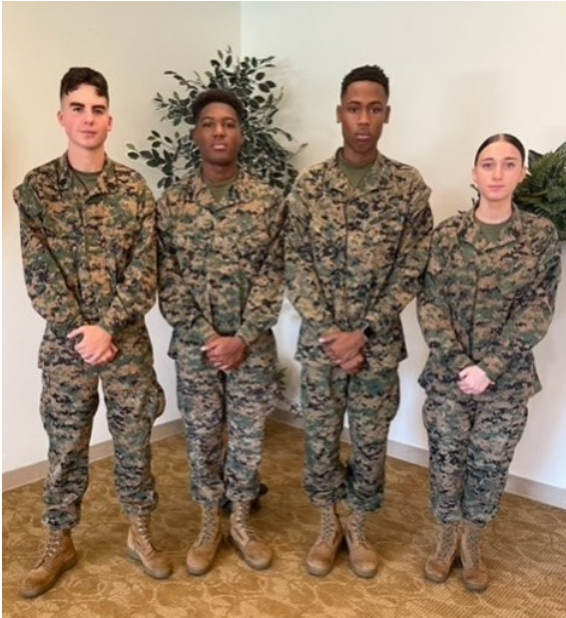
Clearwater High School JROTC Honor Guard